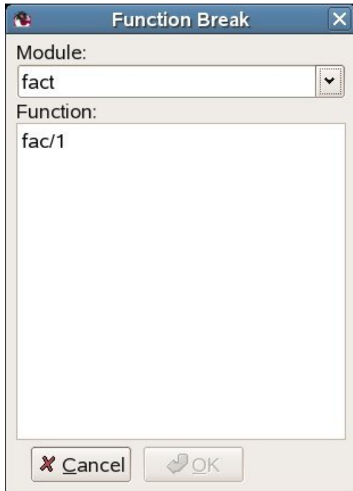
Figure 1.3: The Function Break Dialog Window.

A function breakpoint is a set of line breakpoints, one at the first line of each clause in the given function.