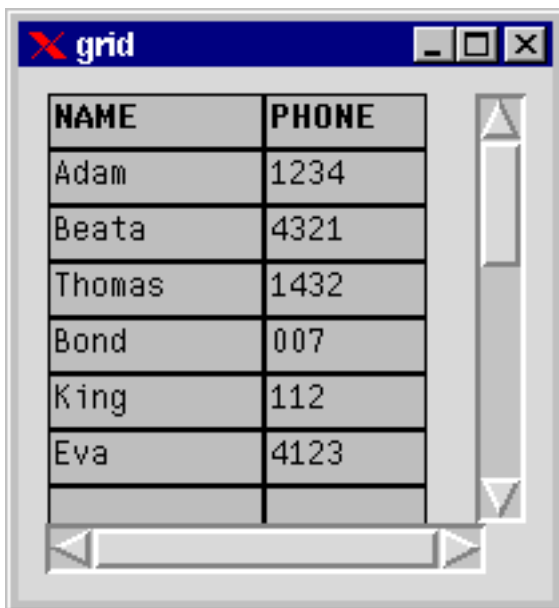
Figure 8.14: Simple Grid

The following simple example shows how to use the grid.