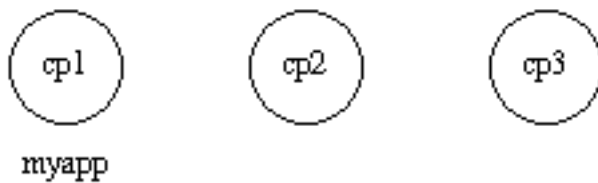
Figure 9.1: Application myapp - Situation 1

Similarly, the application must be stopped by calling application:stop(Application) at all involved nodes.